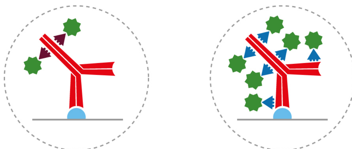
Monoclonal VHH Antibody

Polyclonal AffiniPure-VHH™ Secondary Antibodies offer excellent sensitivity through signal amplification. As seen in Figure 2, polyclonal antibodies achieve higher labeling efficiency than monoclonal antibodies by binding to multiple locations across the primary antibody, generating a brighter signal.